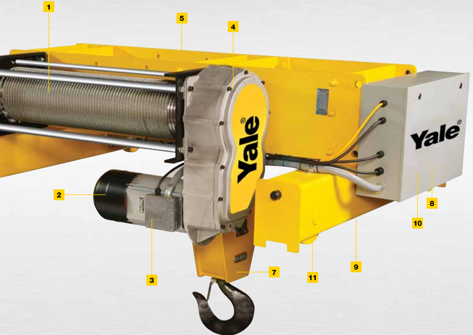
Top-Running Unit Shown Above